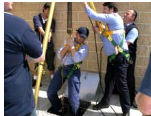
Confined Space Course practical winching.