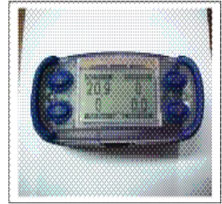
The Impact Gas Monitor, a state of the art 4 gas monitor ideal for confined space entry

The Impact Gas Monitor is available in two configurations. They are the Impact Basic and the Impact Pro.